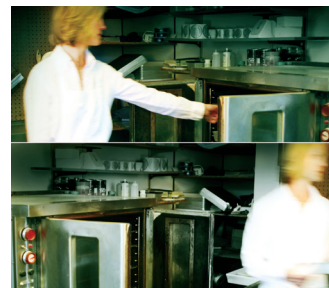
Cloud Nine brownies have become the ultimate locals' gift to Aspen visitors.